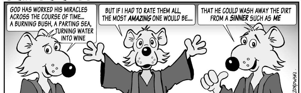
Copyright 2015 Karl A. Zorowski. All rights reserved. Used with permission. Visit us online at www.churchmice.net .